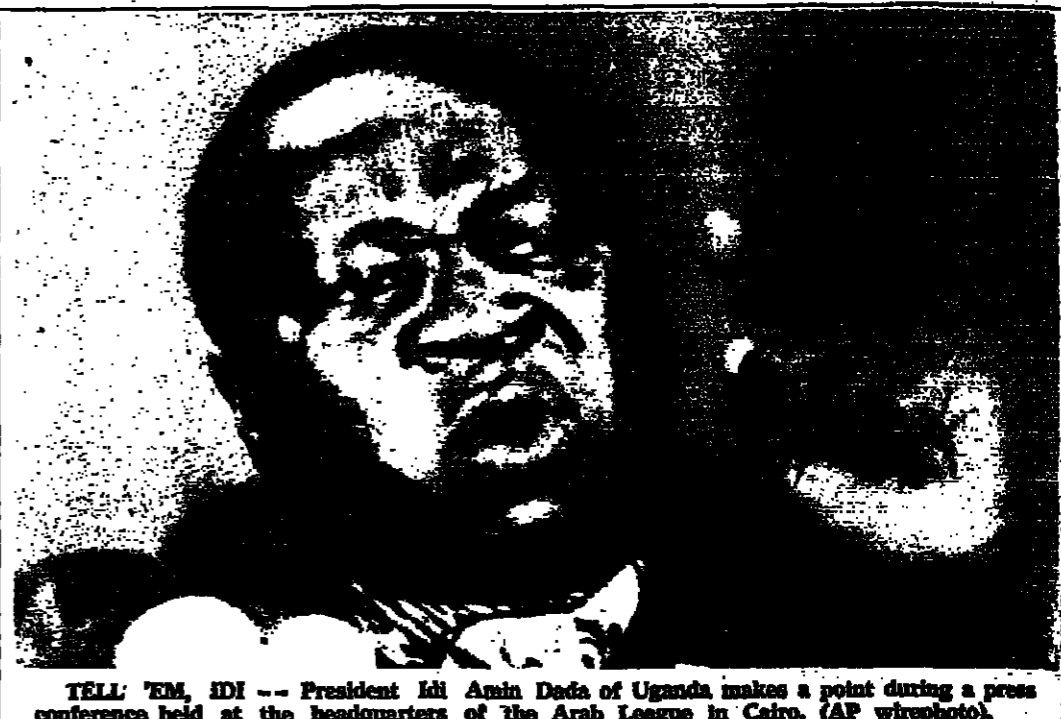
TELL: EM, IDI -- President Idi Amin Dada of Uganda makes a point during a press conference held at the headquarters of the Arab League in Cairo. (AP wirephoto).

The known number of injured, he said, was about 10,500, of whom 2,280 were still in hospitals.